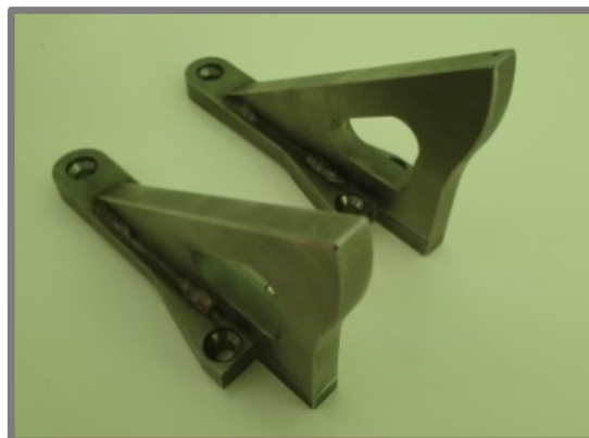
Two new Gnomons.